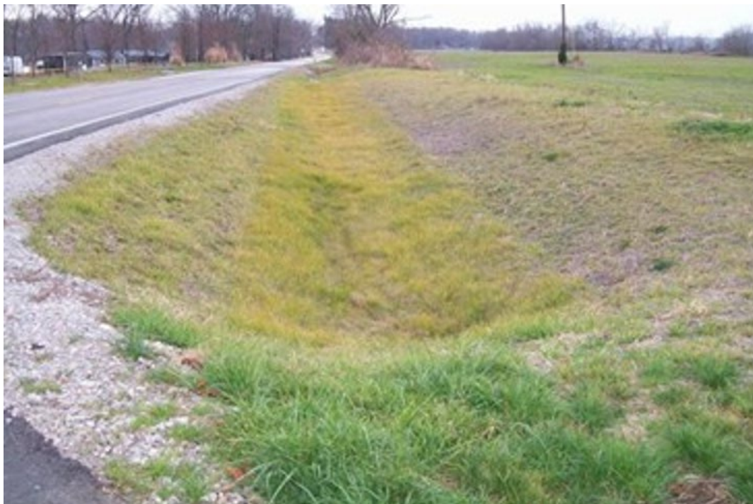
Image 3: Yellow vegetation may be viewed as unhealthy and may require soil enrichment