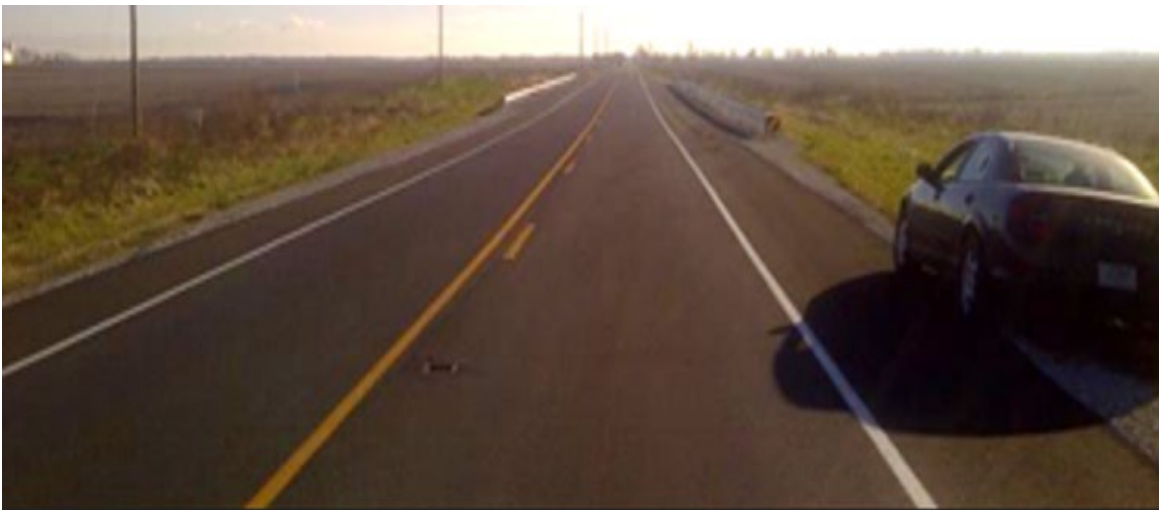
Image 1: Example of both poor placement of the roadway within the picture and poor lighting conditions

A yellow color for vegetation may be viewed as being unhealthy and may require soil enrichment as indicated in Image 3.